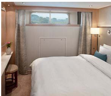
Standard Cabin (E)