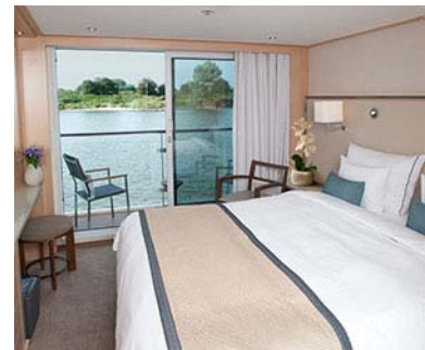
Veranda Cabin (B & A)