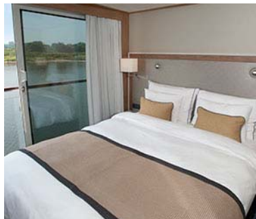
French Balcony (D & C)