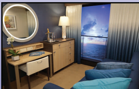
Inside Cabins have a "virtual balcony!"