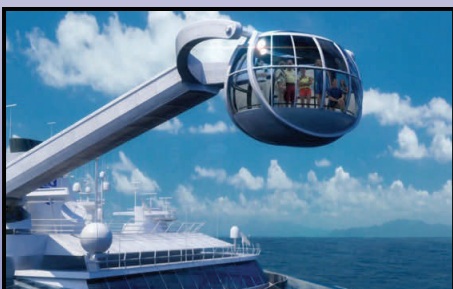
"North Star" Ascends 300 ft above the ocean!

705 Bloomfield Ave, Bloomfield, CT 06002 860-243-1630 • 800-243-1630