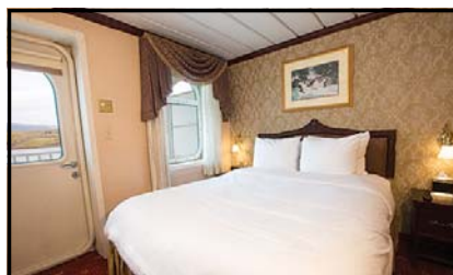
Category C– Deluxe Private Veranda—180 sq feet

Day 9: Clarkston, WA: After breakfast we say goodbye to the wonderful staff and make our way back home taking with us wonderful memories of the Pacific Northwest! Your motorcoach awaits your arrival at Bradley.